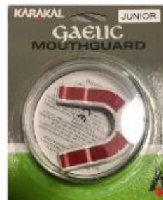
Junior Mouthguard - €10