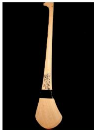
Hurl - from €20