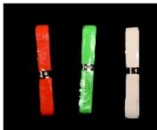
Hurl Grip - Small €5/Large €6