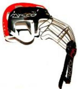
Helmet S/M - €50/L - €60